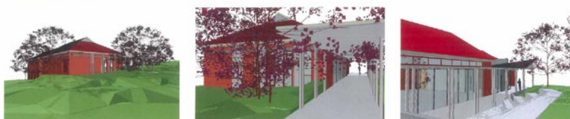
Korowal School, Blue Mountains 54 Hall Pde, Hazelbrook BER - Proposed New Hall