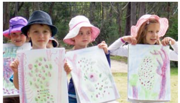
Kindies drawing one of our beautiful rhododendron trees.