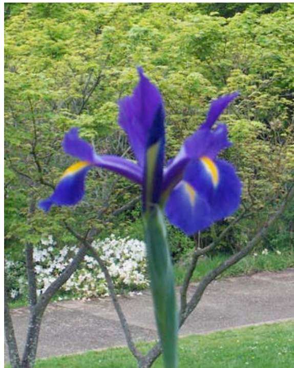
Dutch iris planted by kindergarten in D week

Welcome back everyone to what will be a very busy term, full of lots of exciting events. The intensive swimming scheme starts next Monday for K,1,2. Students from 3,4,5,6 will be starting their lessons on November 15 th . There will be concerts for K,1,2 and 3,4,5 and the very special Class 6 Formal towards the end of term. Years 2 and 6 will be having a